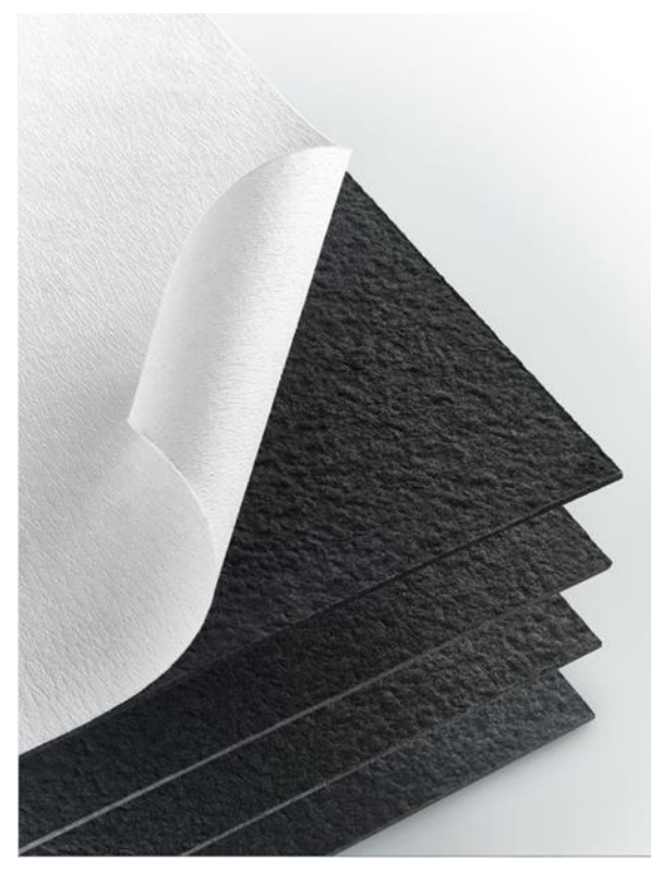
Water throughput BECO ACF 07.10(S)

Adsorption processes are decisively affected by the contact time between the product and the adsorbing substance. The adsorption performance can thus be controlled by the speed of filtration. Slow filtration speeds and extended periods of contact result in optimum utilization of the adsorption capacity.